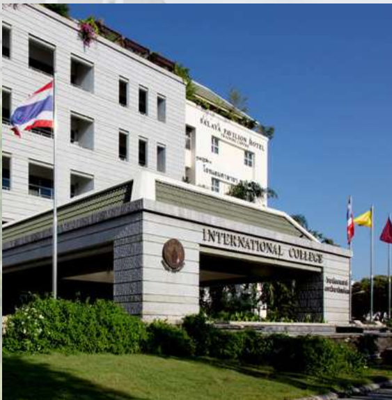
MUIC Building 1