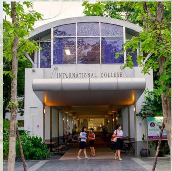
MUIC Building 2