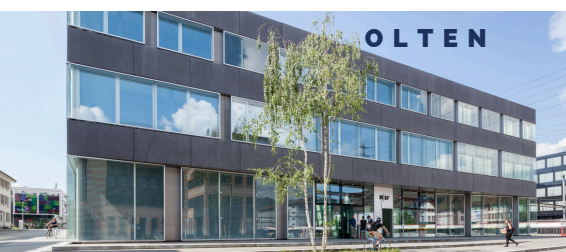
O L T E N