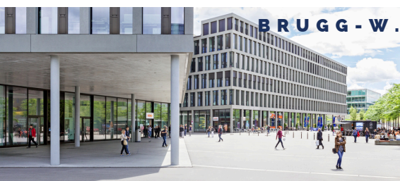
B R U G G - W .